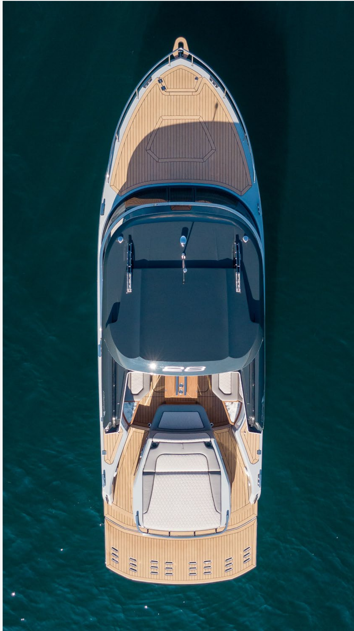
Model 28 Open